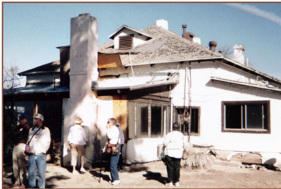
Steam Pump Ranch

Looking around we saw two empty, decaying houses,