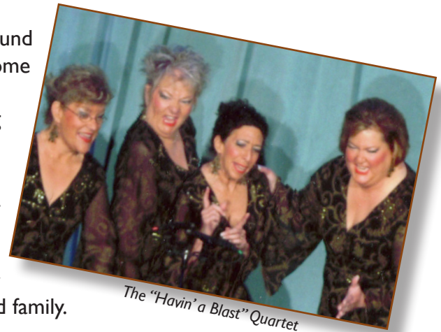
The “Havin’ a Blast” Quartet

The music begins around 6:15PM. Come join us for an evening of fun, music and socializing. See you there – bring your friends and family.