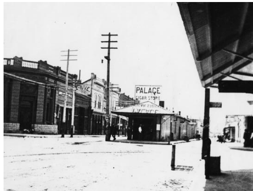
The Wedge, West Congress Street AHS #28990

When prostitution and gambling were legal, and murder and adultery were on the rise, Tucson citizens fought against the city's lawlessness. Tour historical sites and churches, created by citizens to convert sinners.