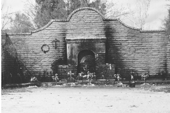
El Tiradito AHS # 58301

Tour a Mexican neighborhood containing beautiful adobe homes, Carmen Teatro (theater), La Pilita Museum, and El Tiradito shrine for lovers.