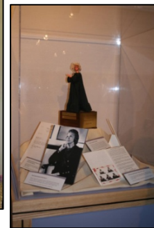
Sandra Day O'Connor Exhibit

The League is very proud of its efforts to preserve the histories of outstanding Arizonans who have been designated as Historymakers™. By contributing oral histories, portraits, photos and memorabilia, the Historymakers and their life stories have become an important part of Arizona's heritage and an integral part of the Arizona Historical Society. The League was honored to have its 2011 Centennial Historymakers Gala sanctioned as the first Arizona Official Centennial Event. The accompanying Historymakers Recognition Program (including website, video and book) is an official Arizona Centennial Legacy Project.