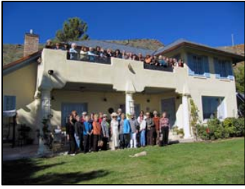
Honey Moon Cottage in Jerome